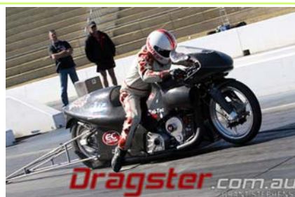
High dollar Buell will be tough to beat